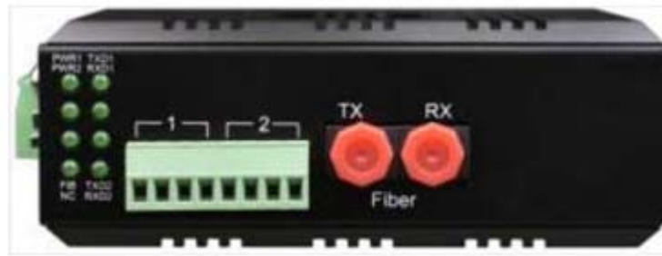
PIC1 : Product picture